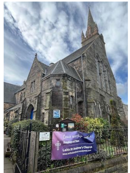
Leith St Andrew's Centre has received funding for feasibility work on community ownership.

dedicated support service for groups to access support more quickly where needed, and a microgrants programme offering support with the cost of community consultation events and communication. This will be particularly helpful for disadvantaged and marginalised communities.