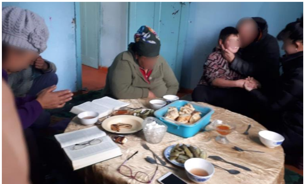
A house church in Kyrgyzstan

Further down, the list, the sharpest rises are seen in Central Asia. The largest rise is in Kyrgyzstan (up 14 places to 47th), where restrictions on religious freedoms and violence against churches have increased. Kazakhstan (38th) and Tajikistan (39th) also rose in the ranking.